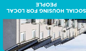
SOCIAL HOUSING FOR LOCAL PEOPLE

Too often local people go to the back of the queue. We will fight against government rules and put local people at the front of the queue.